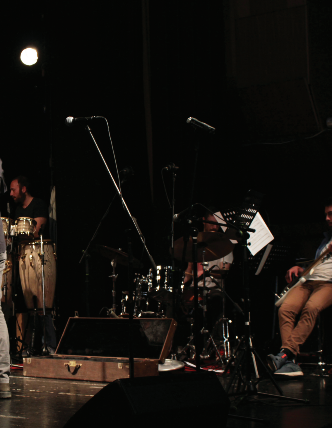
BYJO na probi u Kulturno-informativnom centru "Budo Tomović", Podgorica 27. april 2021.