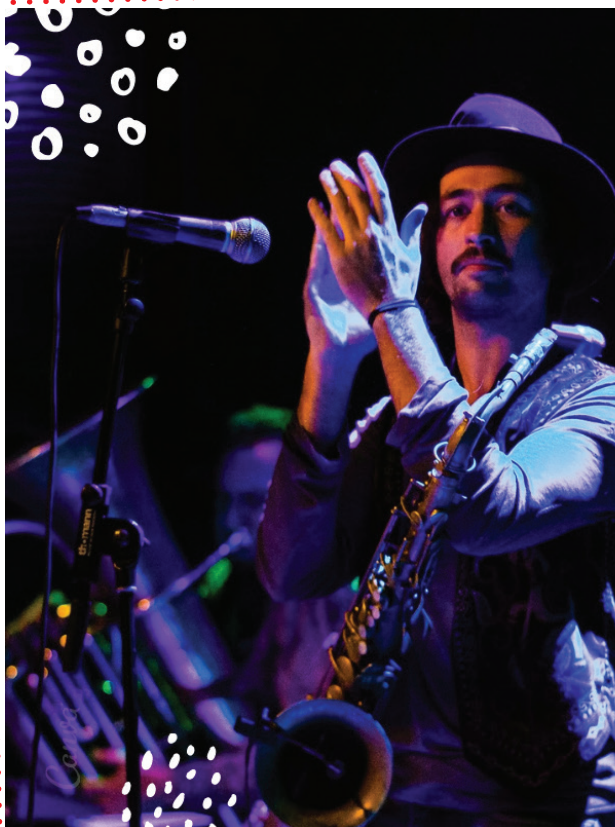
MAK MURTIĆ, COMPOSER

" I am interested in connections across the Balkans as I personally feel there is much more we can say to each other that we understand than the perceived disconnection that we sometimes feel we have. I am interested in the community of the big band or orchestra as a platform for both musical and personal development. "