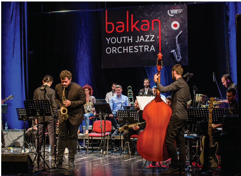
Koncert u Kulturno-informativnom centru "Budo Tomović", Podgorica 29. april 2021.