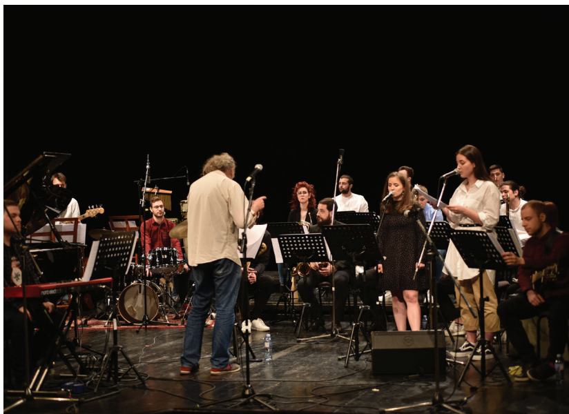
Koncert BYJO u Kraljevskom pozorištu Zetski dom, Cetinje 30. april 2021.